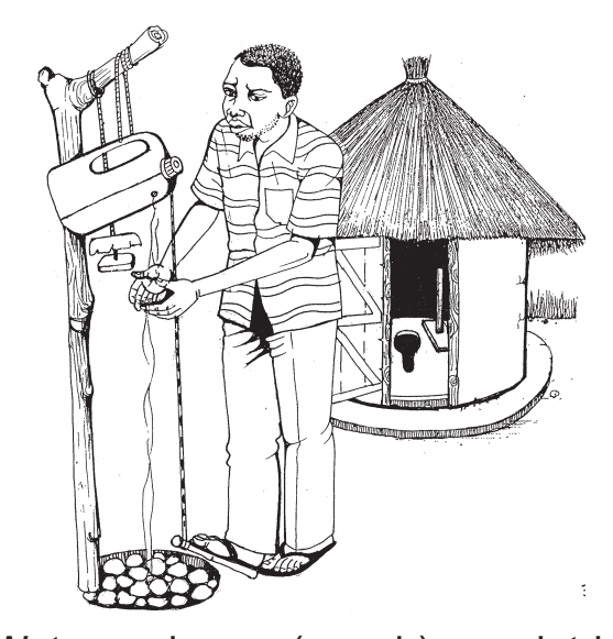
Water and soap (or ash) near latrine