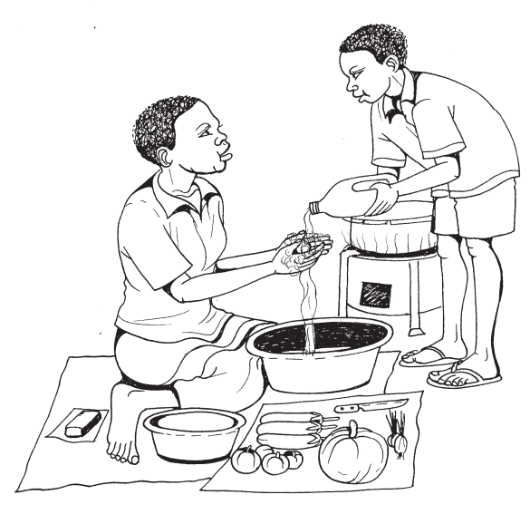
Water and soap (or ash) near cooking area